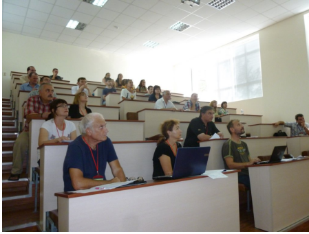
Participants of MMSC 2016

social sciences, etc. Among the goals of the workshop is the stimulation of new research cooperations among the participants, which would lead to novel results.