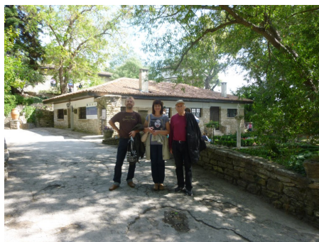
Participants of MMSC 2016 visiting Botanical garden in Balchik