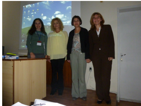
Young scientists awards