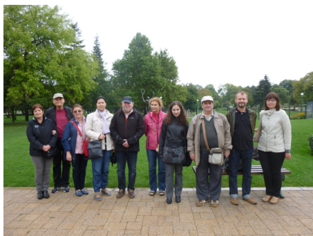
Participants of MMSC 2016 sightseeing Dobrich.